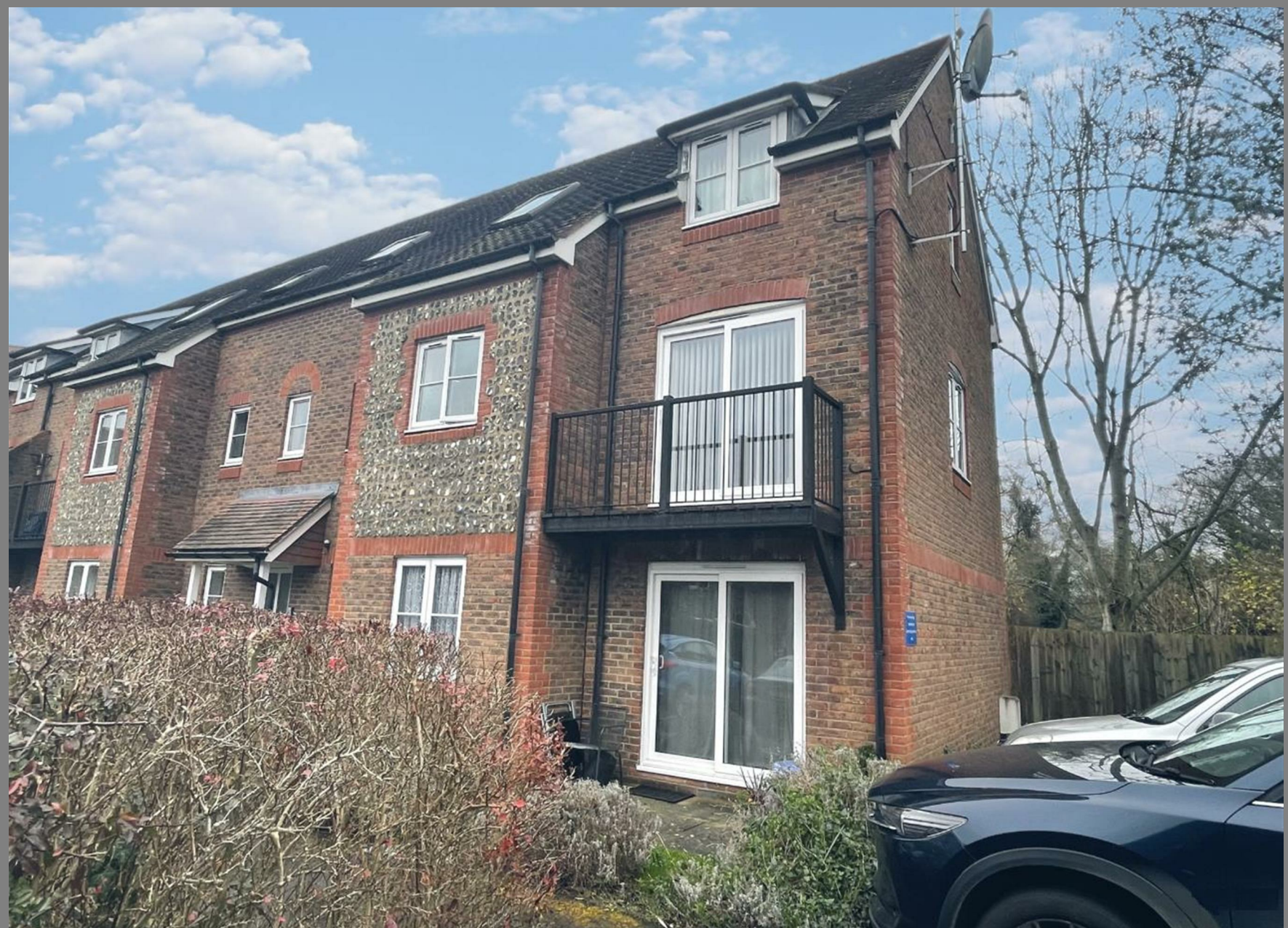
John Norgate House, Two Rivers Way, Newbury, RG14 5TF