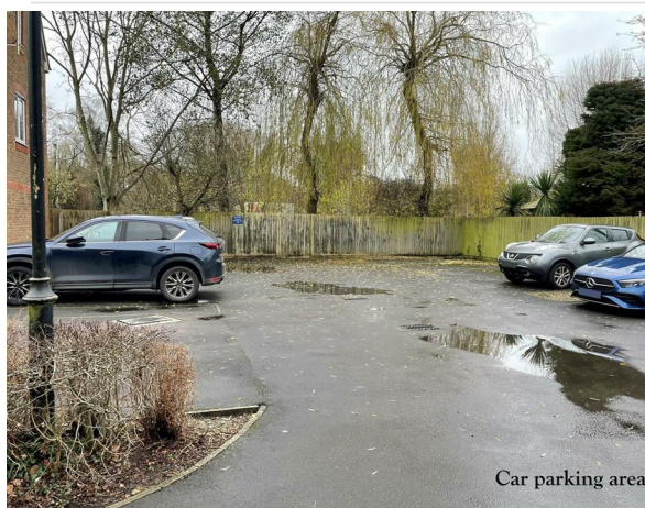
Car parking area

Hillier & Wilson wish to inform prospective purchasers that we have listed the details of this property as a general guide and in good faith. We have not carried out a detailed survey nor tested the services, appliances or specific fittings. Any reference to alterations does not mean that any planning permission, building regulation or other consent has been obtained. Investigations must be made by buyer's solicitor. Room sizes should not be relied upon for carpets and furnishings. Fixtures & fittings are excluded from the property unless stated in the sales particulars.